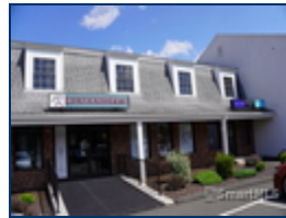
Main Entry + Second Entry